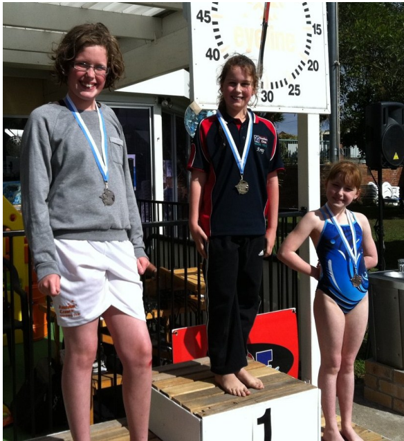
9yrs girls Breaststroke medalists at Cotton Tree.